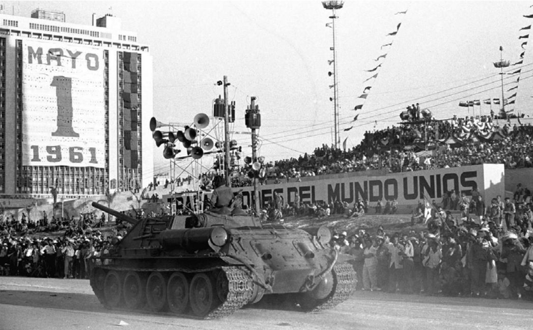
May Day in Havana, Cuba in 1961: the statist cooptation of a grassroots holiday.

In Catalonia, between May 3 and 8, in what came to be known as the May Days, clashes erupted in Barcelona between anarchists and other grassroots participants in the Spanish revolution, on one side, and on the